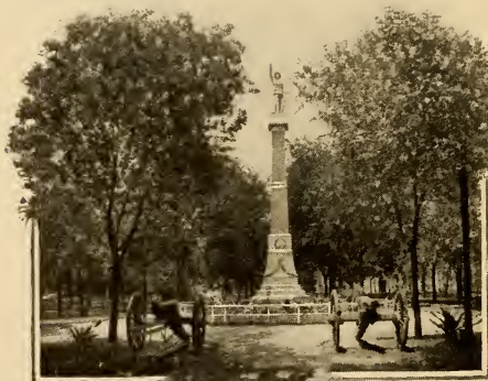
Confederate Monument in Travis Park

trees overarch winding roadways and trail the banks of the San Antonio river.